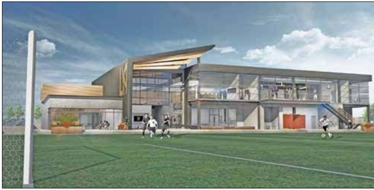
California State University, Los Angeles, is the home of the Los Angeles Football Club's new training facility.