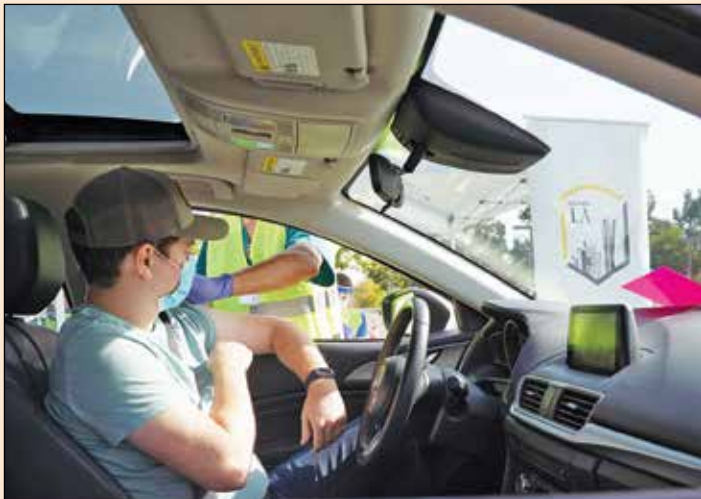
Hundreds of people receive free flu shots during a drive-thru clinic at Cal State LA in November 2020. The flu shot clinic and Cal State LA's participation in the COVID-19 vaccination effort are part of the university's We Are Healthy LA initiative, a collaboration with community partners to provide basic needs and help ensure health and safety during the pandemic.